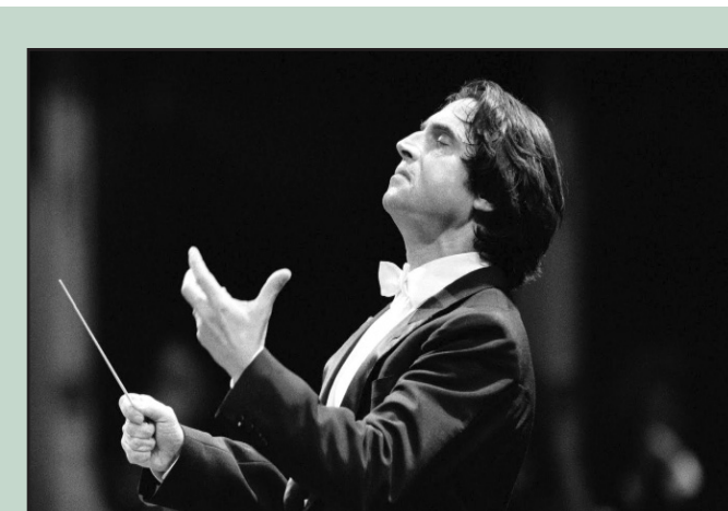
And the winner is.... Riccardo Muti and the Vienna Philharmonic!

"Suzanne Danco is probably my favorite Donna Anna, because she really brings out the crazy in the character."