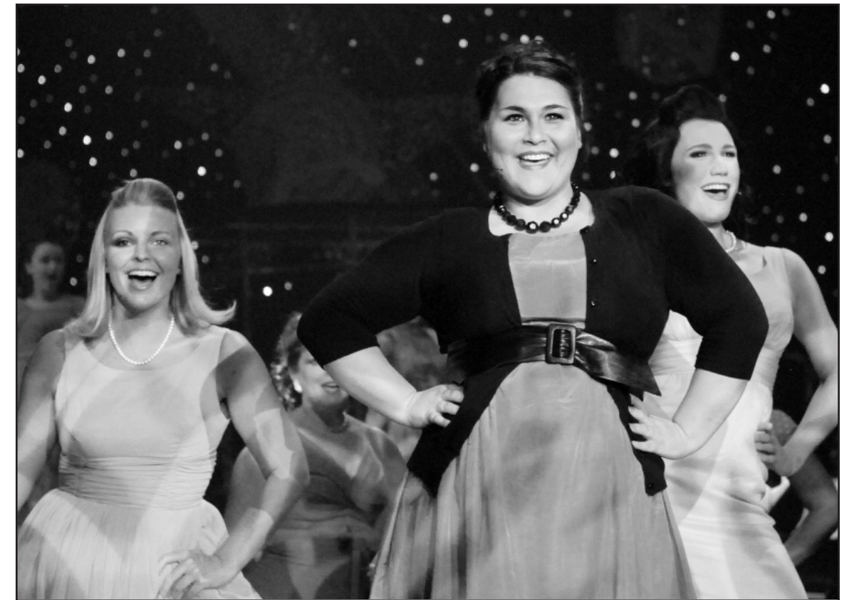
The special energy of Grand Night has thrilled audiences for over two decades.